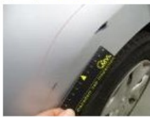
Door R L, Scratch(es), LI - Repair and paint (complete) 318,35