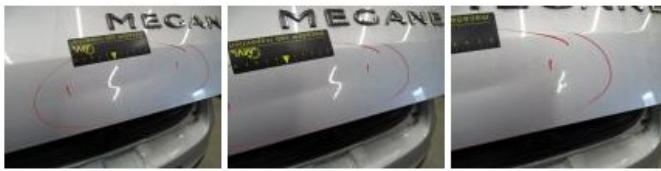
Bonnet, Bump(s) and scratch(es), LI - Repair and paint (complete) 290,08