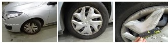
Wheel cover R L, Scratch(es), E - Replace