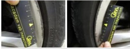
Alloy rim F L, Scratch(es), LI - Repair and paint (complete) 95,00