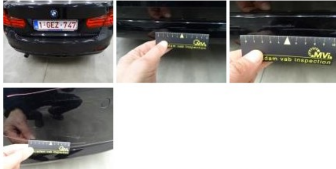
Tailgate, Chemical polution, LI - Repair and paint (complete) 301,68