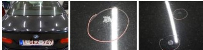
Bonnet, Chemical polution, LI - Repair and paint (complete) 290,08