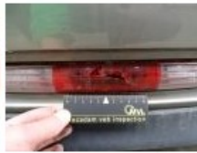
Wing R R, Bump(s), Acceptable