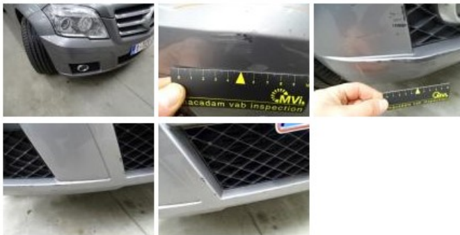
Front bumper, Scratch(es), LI - Repair and paint (complete) 254,16