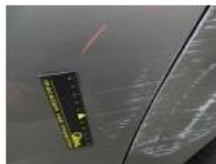
Alloy rim R R, Scratch(es), LI - Repair and paint (complete)