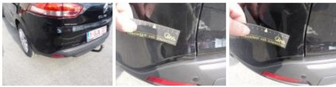
Bonnet, Bump(s) and scratch(es), LI - Repair and paint (complete)