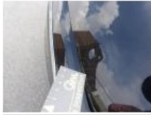
Wheel cover F L, Scratch(es), Acceptable