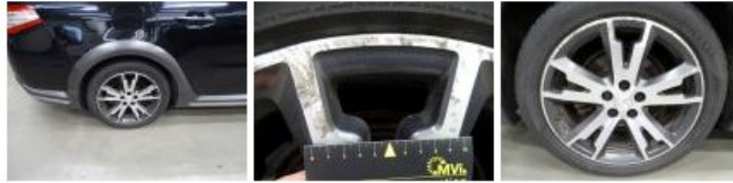
Alloy rim F L polished, Scratch(es), LI - Repair and paint (complete) 95,00