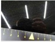
Armrest lid F Mid, Damaged, Acceptable 0,00