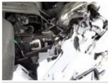
Interior, Damaged, P - Check