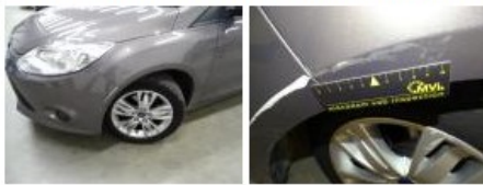
Door R R, Bump(s) and scratch(es), LI - Repair and paint (complete) 318,35