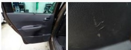
Door R L, Bump(s) and scratch(es), LI - Repair and paint (complete)