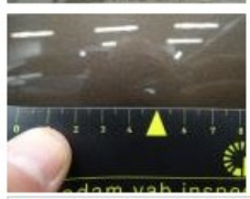
Wing F R, Scratch(es), LI - Repair and paint (complete) 220,18