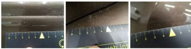
Wing R R, Bump(s) and scratch(es), LI - Repair and paint (complete)