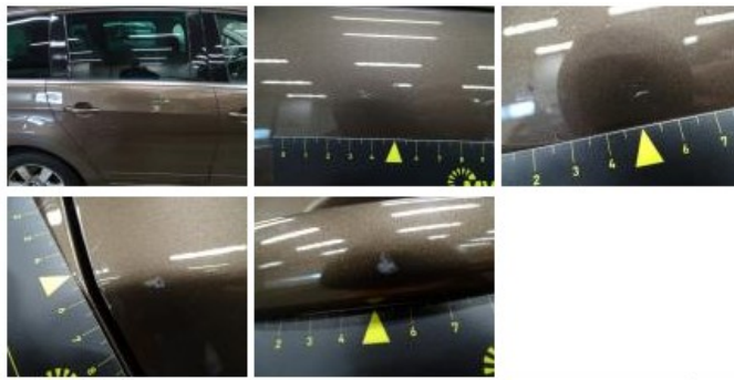
Door F L, Bump(s) and scratch(es), LI - Repair and paint (complete) 318,35