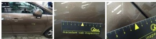
Door F R, Bump(s) and scratch(es), LI - Repair and paint (complete) 318,35