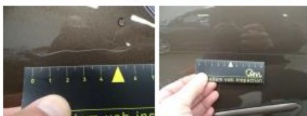
Door R R, Scratch(es), LI - Repair and paint (complete)