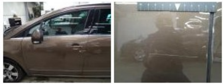
Rocker panel inner F L, Scratch(es), Acceptable 0,00