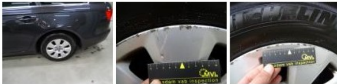
Bumper corner R R, Scratch(es), It - Spot repair 115,56