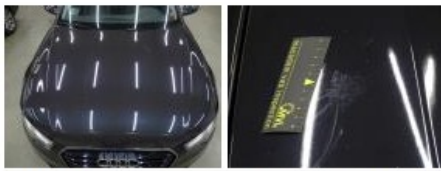
Wing F R, Chemical polution, LI - Repair and paint (complete) 264,21