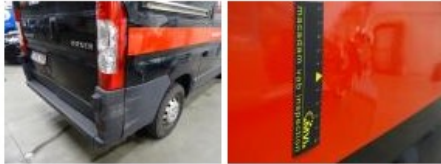
Bumper corner R R, Damaged, E - Replace 680,00