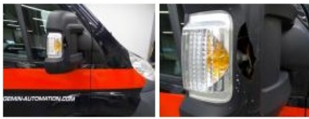
Wing R L, Bump(s) and scratch(es), LI - Repair and paint (complete) 327,15