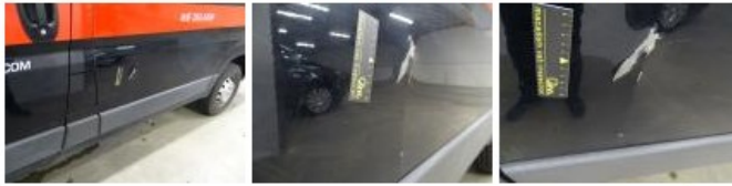
Wing R R, Bump(s), LI - Repair and paint (complete) 231,15