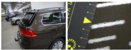
Rear window, Scratch(es), E - Replace 0,00