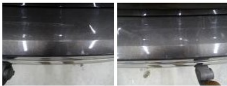
Front bumper, Scratch(es), LI - Repair and paint (complete) 211,80