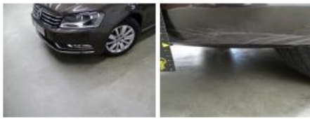
Bonnet, Hail damage, PDR - Hail 125,00