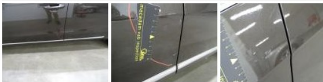
Wing R R, Stone chip(s), Paint 0,00