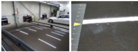
Bonnet, Bad repair, Paint 0,00