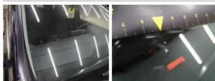
Roof, Chemical polution, LI - Repair and paint (complete) 481,50