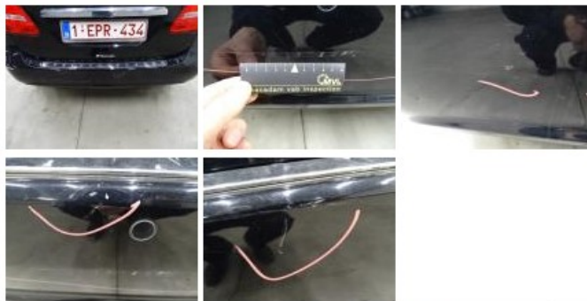
Tailgate, Chemical polution, LI - Repair and paint (complete) 301,68