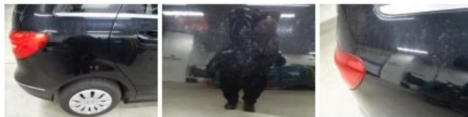
Door R R, Chemical polution, LI - Repair and paint (complete) 318,35