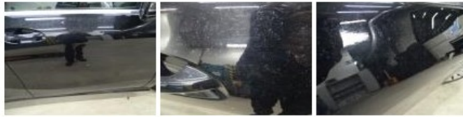
Rearview mirror housing L, Chemical polution, LI - Repair and paint (complete) 115,56