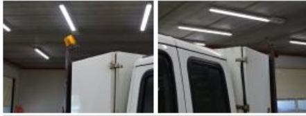
Wing R R, Scratch(es), It - Spot repair 115,56