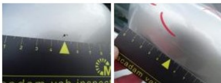
Wheel cover F R, Scratch(es), E - Replace 24,00