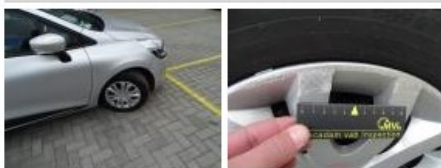
Wheel cover F L, Scratch(es), E - Replace 24,00