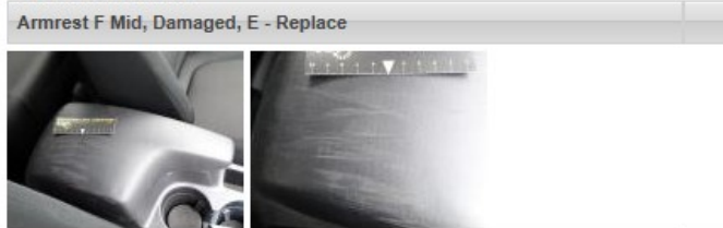
Armrest F Mid, Damaged, E - Replace