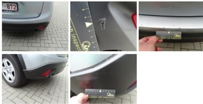
Trunk lid covering R, Scratch(es), E - Replace