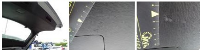
Ceiling, Damaged, E - Replace