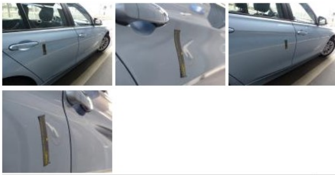
Roof, Bump(s), LI - Repair and paint (complete) 481,50