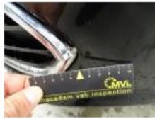
Alloy rim F R, Scratch(es), LI - Repair and paint (complete) 95,00