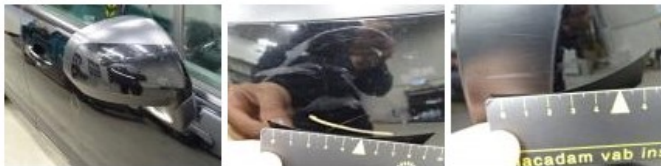
Door R L, Scratch(es), Acceptable 0,00