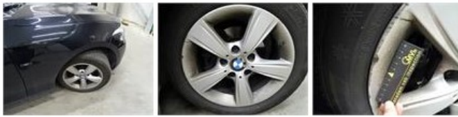
Wing R R, Scratch(es), LI - Repair and paint (complete) 308,20