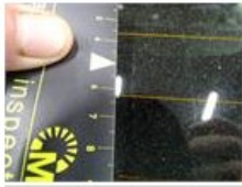
Wing F R, Bump(s), PDR - Knock out without painting 63,00