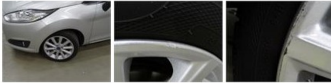
Alloy rim F R, Damaged, E - Replace 192,96