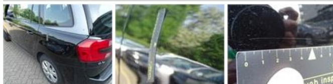
Door frame R L, Bump(s) and scratch(es), It - Spot repair