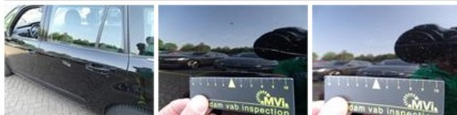
Wing R L, Bump(s) and scratch(es), Acceptable