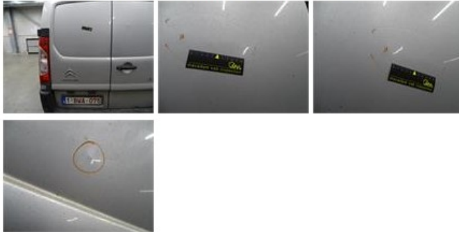
Internal Boot Lining R, Damaged, Smart repair 110,64