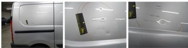
Door R R, Bump(s), Acceptable 0,00