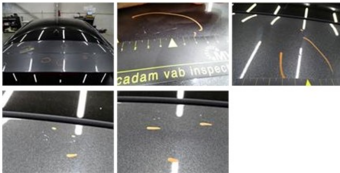
Bumper R, Scratch(es), LI - Repair and paint (complete) 169,44