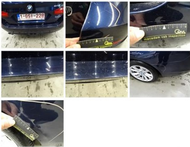
Front bumper, Bump(s) and scratch(es), LI - Repair and paint (complete) 254,16