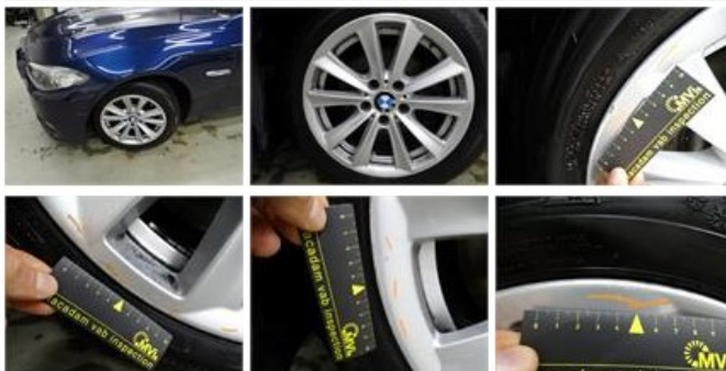
Alloy rim R L, Scratch(es), Acceptable 0,00