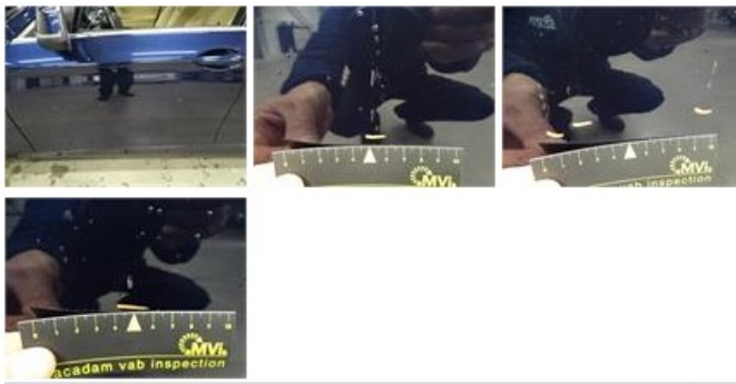
Alloy rim F R, Scratch(es), LI - Repair and paint (complete) 95,00