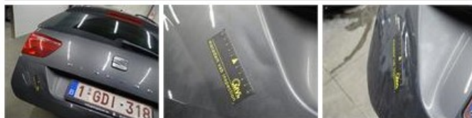
Rocker panel inner R R, Bump(s) and scratch(es), LI - Repair and paint (complete)