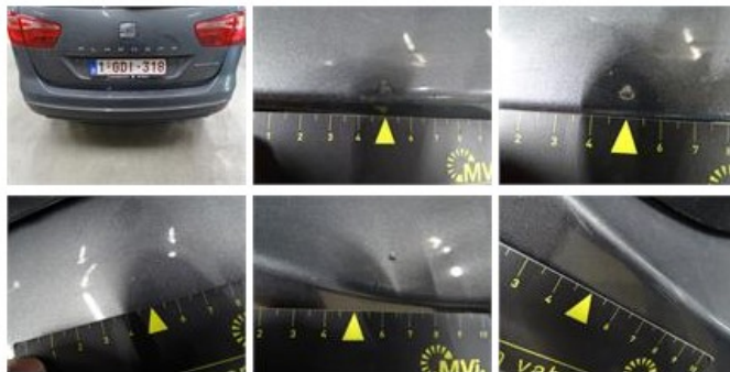
Door panel F R, Scratch(es), Smart repair