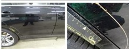
Rocker panel inner R R, Scratch(es), Acceptable 0,00