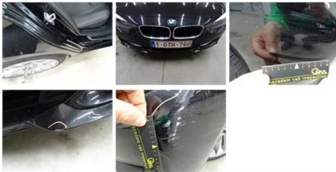
Alloy rim F R, Scratch(es), LI - Repair and paint (complete) 95,00