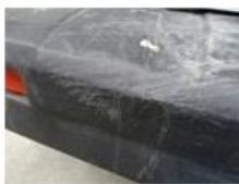
Front bumper, Scratch(es), LI - Repair and paint (complete) 158,85