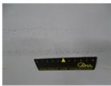
Aerial, Damaged, E - Replace 11,25