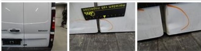
Wing R L, Scratch(es), LI - Repair and paint (complete) 231,15