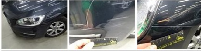
Alloy rim F R, Scratch(es), LI - Repair and paint (complete) 95,00