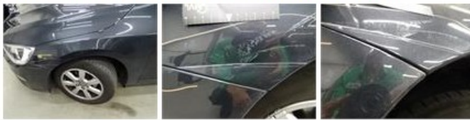
Front bumper, Scratch(es), LI - Repair and paint (complete) 211,80