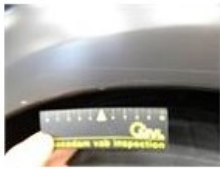
Alloy rim F R polished, Scratch(es), LI - Repair and paint (complete) 95,00