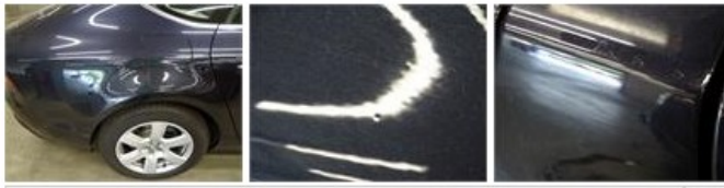
Bonnet, Bump(s), PDR - Knock out without painting 63,00