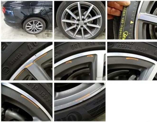
Alloy rim F L polished, Scratch(es), LI - Repair and paint (complete) 95,00