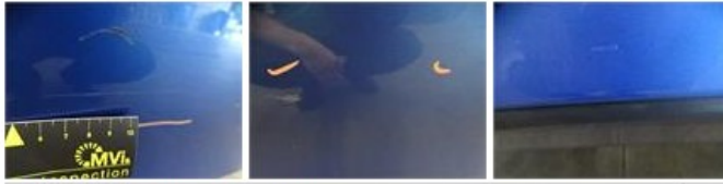
Door F L, Scratch(es), Acceptable