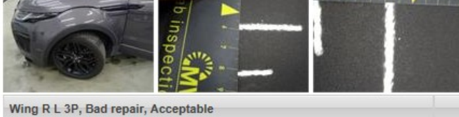
Wing R L 3P, Bad repair, Acceptable 0,00