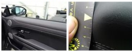
Centre console, Damaged, Acceptable 0,00