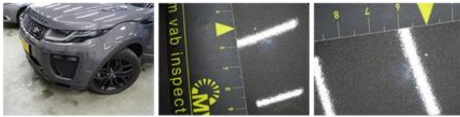
Wing F R, Bad repair, Acceptable 0,00