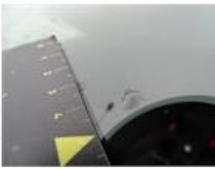
Roof, Bump(s), PDR - Knock out without painting 102,60