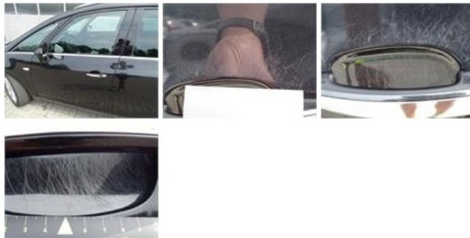
Tailgate, Scratch(es), LI - Repair and paint (complete) 301,68