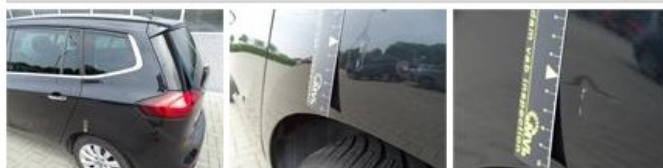
Door R L, Bump(s) and scratch(es), Acceptable 0,00