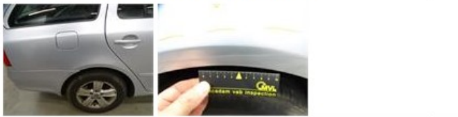
Door F R, Scratch(es), LI - Repair and paint (complete)