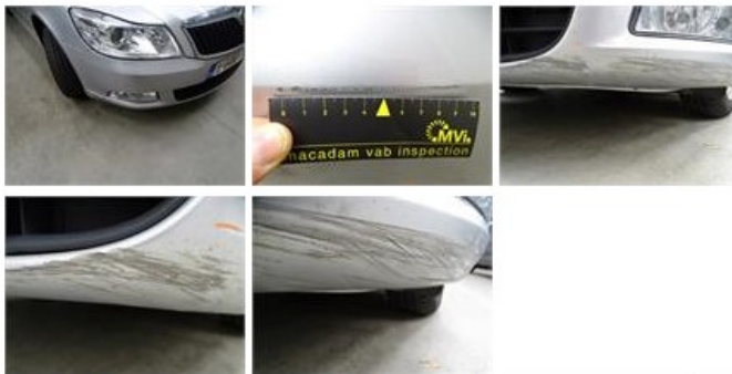
Wing R R, Scratch(es), LI - Repair and paint (complete)