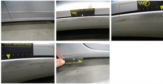
Front bumper, Scratch(es), LI - Repair and paint (complete)