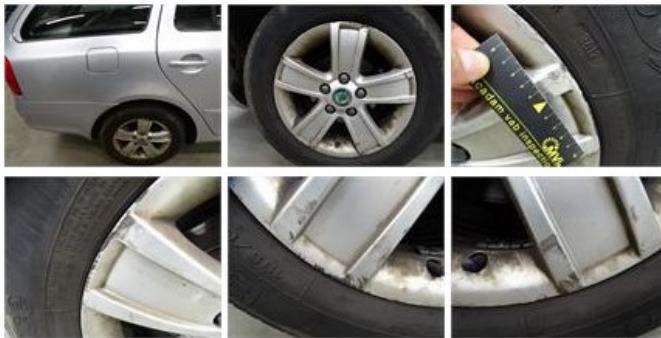
Alloy rim R L, Scratch(es), LI - Repair and paint (complete)