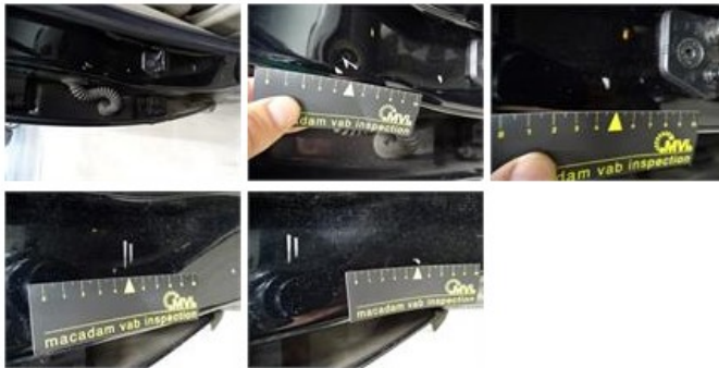
Front bumper, Scratch(es), LI - Repair and paint (complete) 254,16