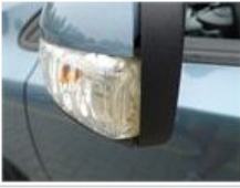
Vanity mirror, Damaged, E - Replace 72,00