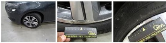
Door R R, Bump(s) and scratch(es), LI - Repair and paint (complete) 366,35