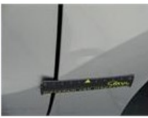
Front bumper, Scratch(es), LI - Repair and paint (complete)