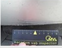
Sill outer R, Damaged, Le - Replace and paint