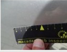
Backrest cover R R, Worn, Acceptable