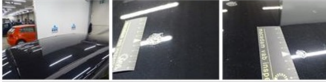
Door R R, Scratch(es), Acceptable 0,00