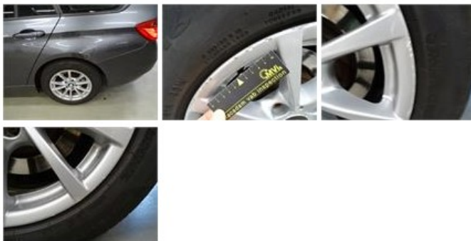
Door R L, Bump(s) and scratch(es), LI - Repair and paint (complete) 318,35