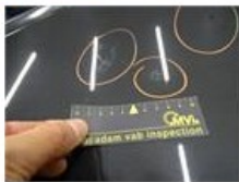
Wing R L, Scratch(es), It - Spot repair 115,56