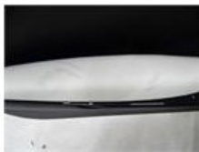
Wing F R, Scratch(es), It - Spot repair 115,56