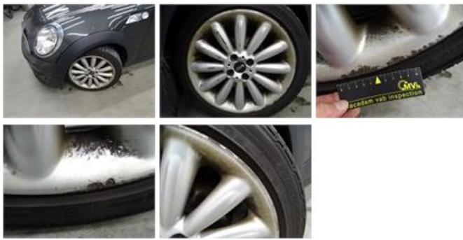
Alloy rim F R, Scratch(es), LI - Repair and paint (complete) 95,00