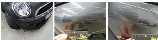
Bumper R, Scratch(es), Acceptable 0,00