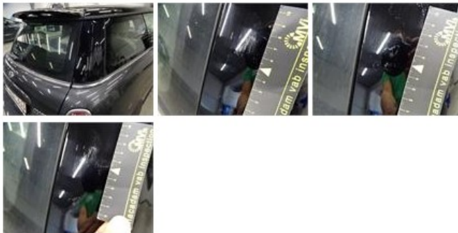
Wing R R, Chemical polution, LI - Repair and paint (complete) 100,00