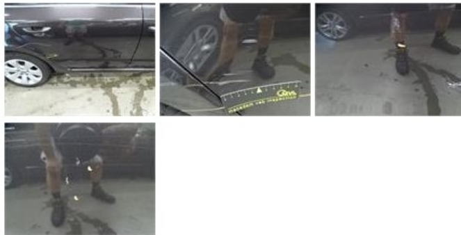
Front bumper, Scratch(es), LI - Repair and paint (complete) 254,16