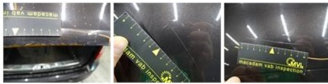
Bonnet, Chemical pollution, LI - Repair and paint (complete) 348,09