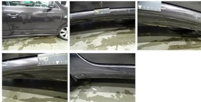
Door R R, Scratch(es), LI - Repair and paint (complete) 382,02