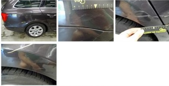
Bumper R, Scratch(es), LI - Repair and paint (complete) 254,16