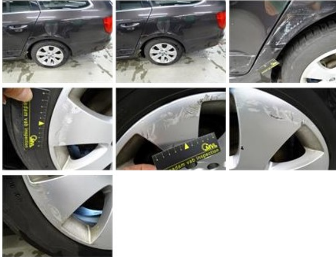
Alloy rim F L, Scratch(es), LI - Repair and paint (complete) 95,00