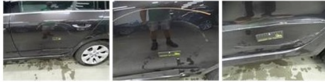
Sill outer R, Bump(s) and scratch(es), LI - Repair and paint (complete) 0,00