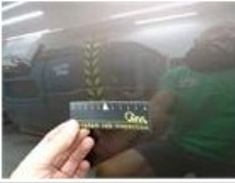
Bonnet, Chemical polution, LI - Repair and paint (complete)